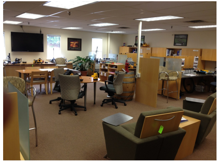
Sample Office Space for New Tenant